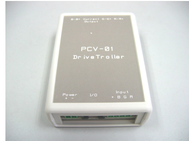
All dimensions in mm